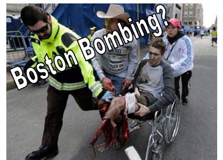
Suspiciously alert, calm man with lower leg blown off exposing tibia.

If you do conduct mass shooting drills be on the alert for interference and investigate everything during and afterward and make it public.